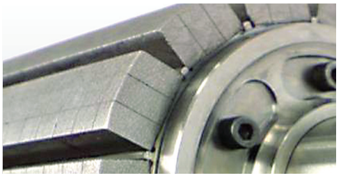
Outperform your competition, RECOMA 35E

RECOMA 35E delivers the highest energy product available